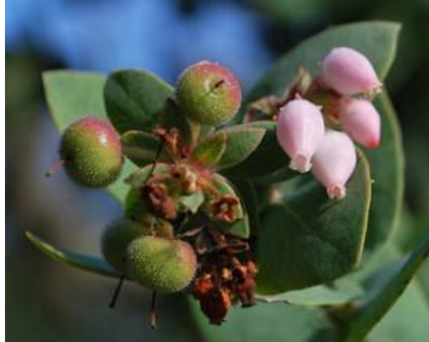
Manzanita (Tcuttur) with flowers and ripening fruit.