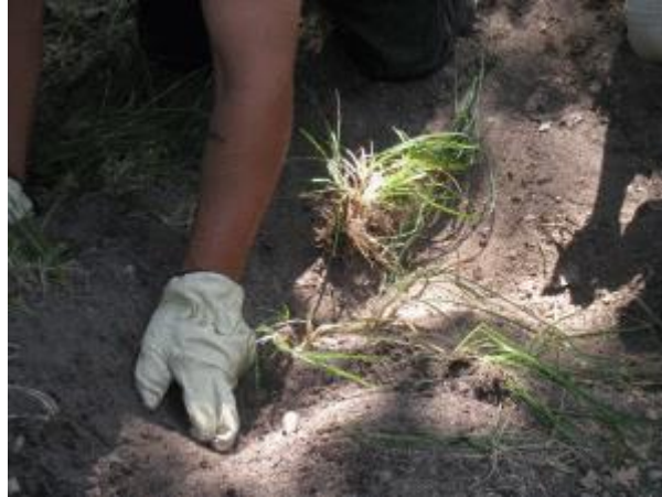
Tending white root sedge for basket weaving at Pinnacles National Park.