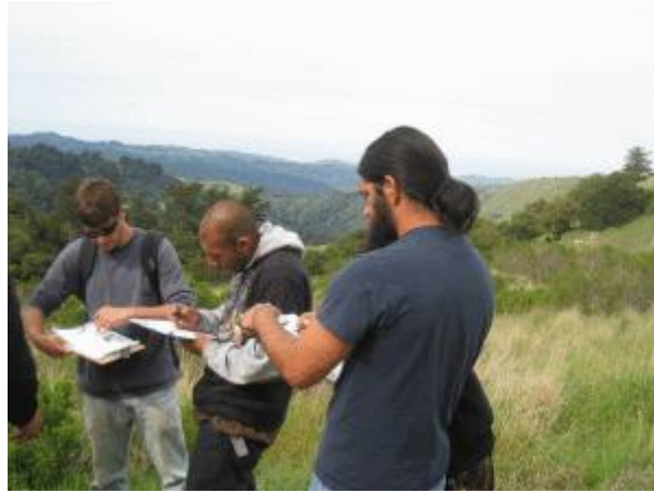
AMLT Native Stewardship Corps recording ethnobotanical information on Midpeninsula Regional Open Space District lands.

was expressed through prayer, ceremonies, and songs that were given to the Amah Mutsun by the Creator to help them fulfill their stewardship responsibilities.