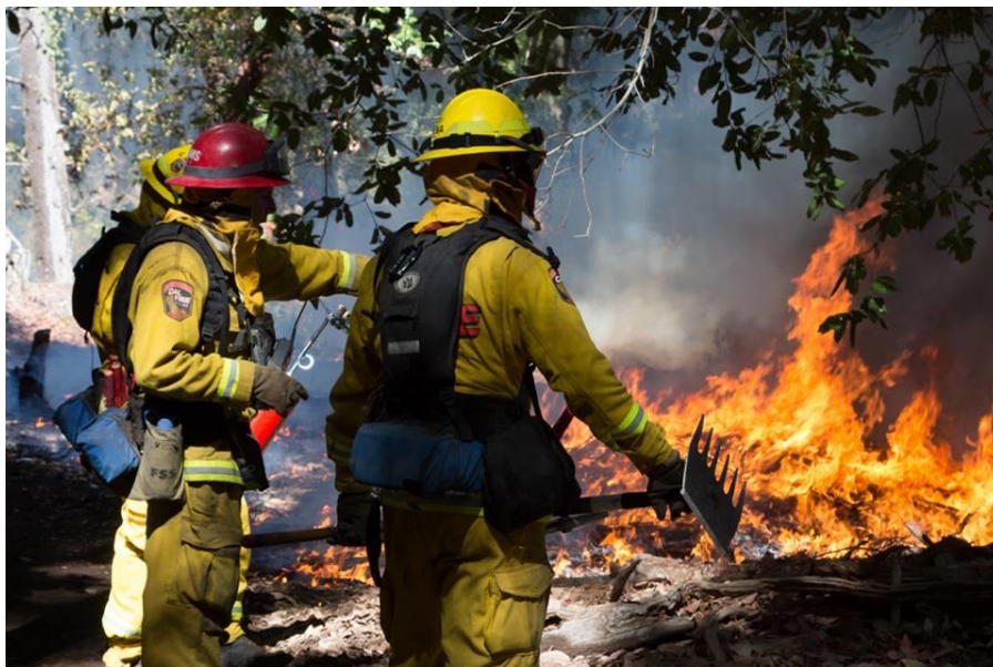
Prescribed burn at San Vicente redwoods.

PBS is currently developing a four-part series titled America Rediscovered . This series explores the world created by the first peoples of the Americas. The goal of this series is to show Native American cultures at the intersection of indigenous knowledge and cutting edge scholarship and science. Our Amah Mutsun Tribal Band was chosen as one of the tribes that will appear in this series. On October 10th, PBS filmed the AMLT’s participation in a controlled burn in the San Vicente Redwoods.