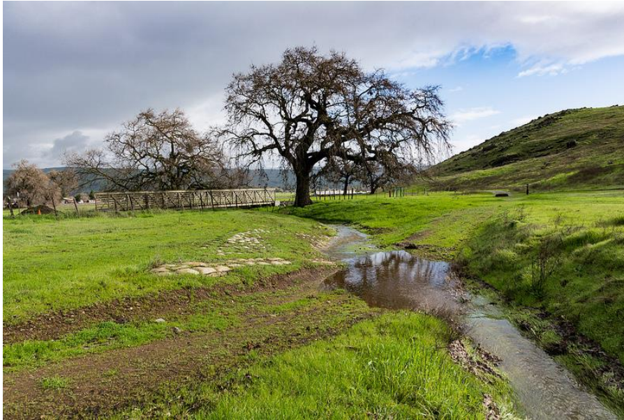
Creek flowing in Coyote Valley.

In Santa Clara County there are two land development proposals that our Tribe is opposing. The first project involves a proposal to extract 320 acres of sand and gravel over 30 years. This project is at Juristac, now known as Sargent Ranch. Juristac translates to “Place of the Big Head” and is the home of our Spiritual Leader, Kuksui. Juristac was the location of many of our sacred ceremonies. Juristac is also the location of four known village sites; a river and many springs; an abundance of wildlife; and for thousands of years and hundreds of generations, many of our ancestors were buried at this location. In 1862 there was a smallpox epidemic, and over 300 of our ancestors were buried at this location.