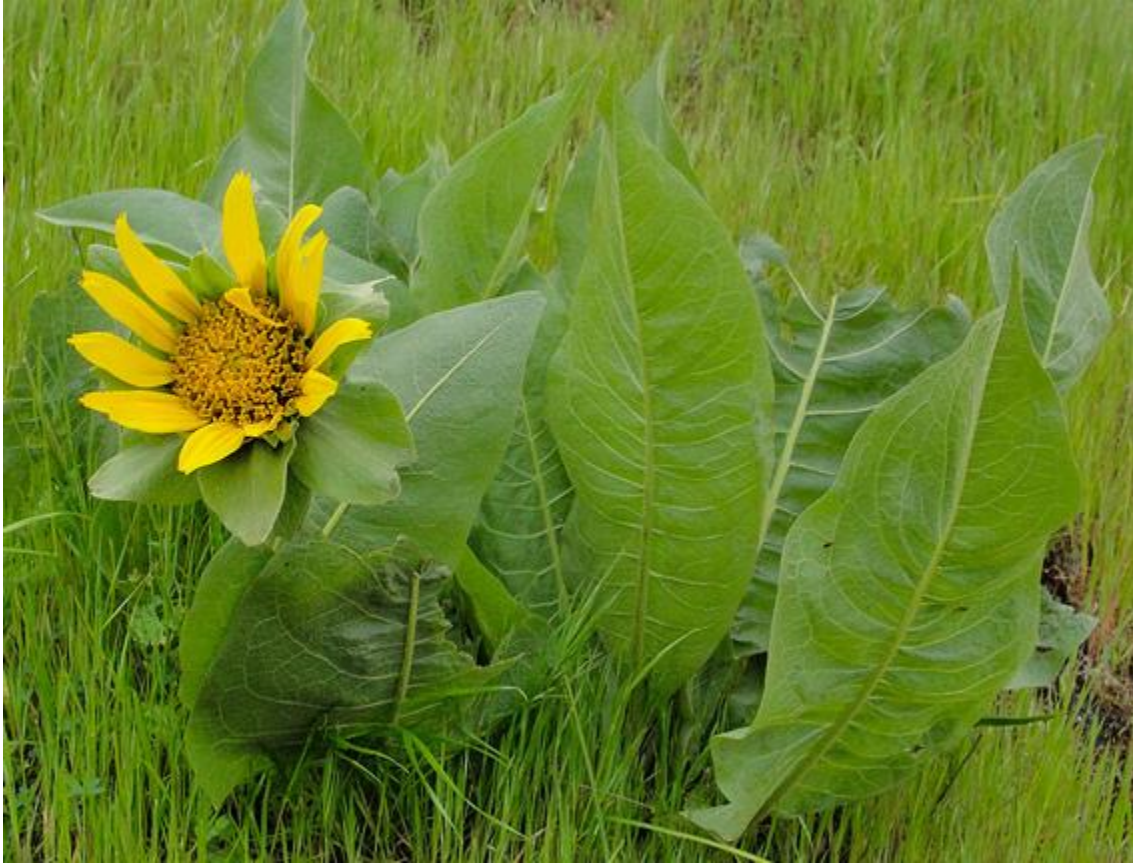
Mule's ears (soorokwa).